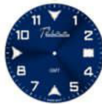
2955C SUNRAY 80 pcs