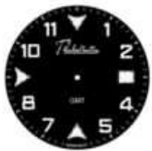
POLISH BLACK 80 pcs