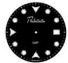
POLISH BLACK 80 pcs