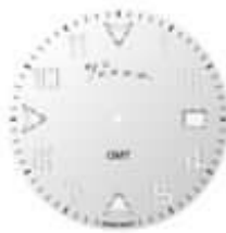
CERAMIC WHITE 80 pcs