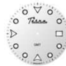
CERAMIC WHITE/BLACK EDGE 80 pcs