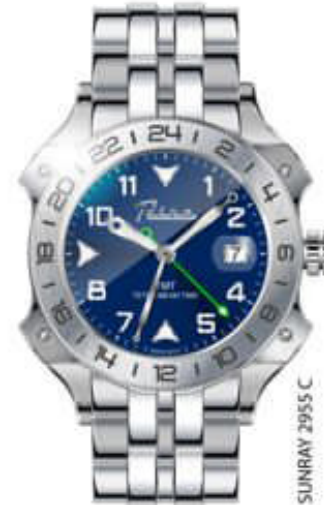
SUNRAY 2955 C