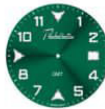
349C SUNRAY 80 pcs